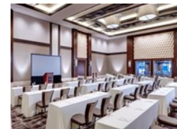
SMALL MEETING ROOM