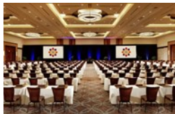
GENERAL MEETING ROOM